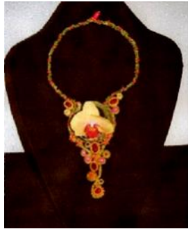
A floral design commissioned for the convention