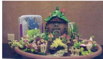
A silent auction item created by District III