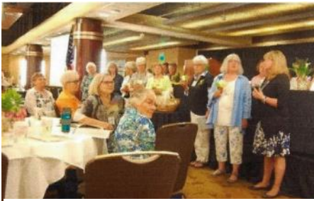
Memorial Service at MGC Convention.

All speaker's themes were related to pollinators, attracting them and providing habitat. It was a jam packed second day. I'm not sure how we got everything in, but we did. The Kalamazoo Garden Council put on a Standard Flower Show on the same day as the annual meeting. Because the flower show was open to the public it drew attention to the council and the state garden club.